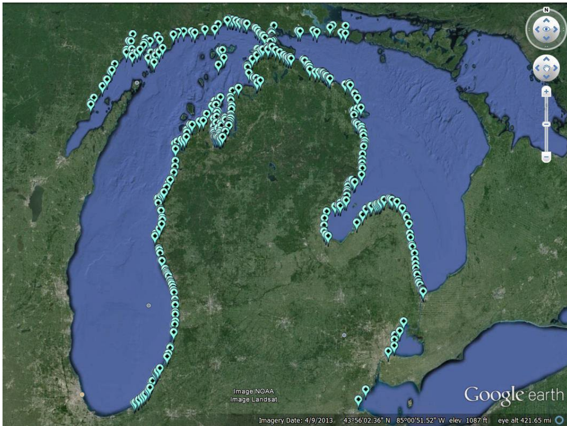
Figure 2: Locations of 451 public great lakes beaches in demand model choice set